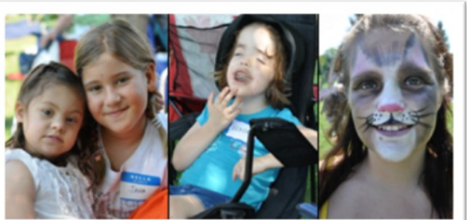
Family, ice cream, and face-painting—good reasons to smile!

Would you prefer to receive your newsletter by e-mail? If so, please send your request to generalmail@jenash.org