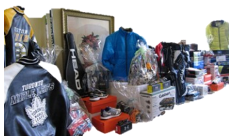
The selection of donated prizes was amazing!