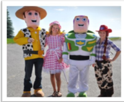
Woody, Bo-Peep, Buzz, & Jessie cheer on walkathon participants.

What a way to end the summer! Saturday, August 27, commemorated the JACC 16th Annual Country BBQ—a Toy Story™ inspired gathering of over 1,000 people. A sea of turquoise volunteer t-shirts transformed Prince Lee Acres with tents &