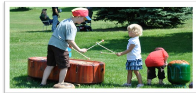
Making some NOISE on the "Dog Bite Steel" Bongers.