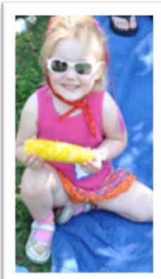
Every BBQ needs corn on the cob!

Whether fishing at the pond, swinging a golf club, caring for bears at the Teddy Bear Clinic, decorating freshly baked cookies, visiting the petting zoo, getting an intricate face painting, or relaxing under a shady tree, there was something for everyone.