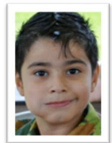
See you next year!

Mark your calendars for Saturday, August 25, 2012 for our Annual Country BBQ. Interested in volunteering or assisting? Call us at 905-852-1799 X22